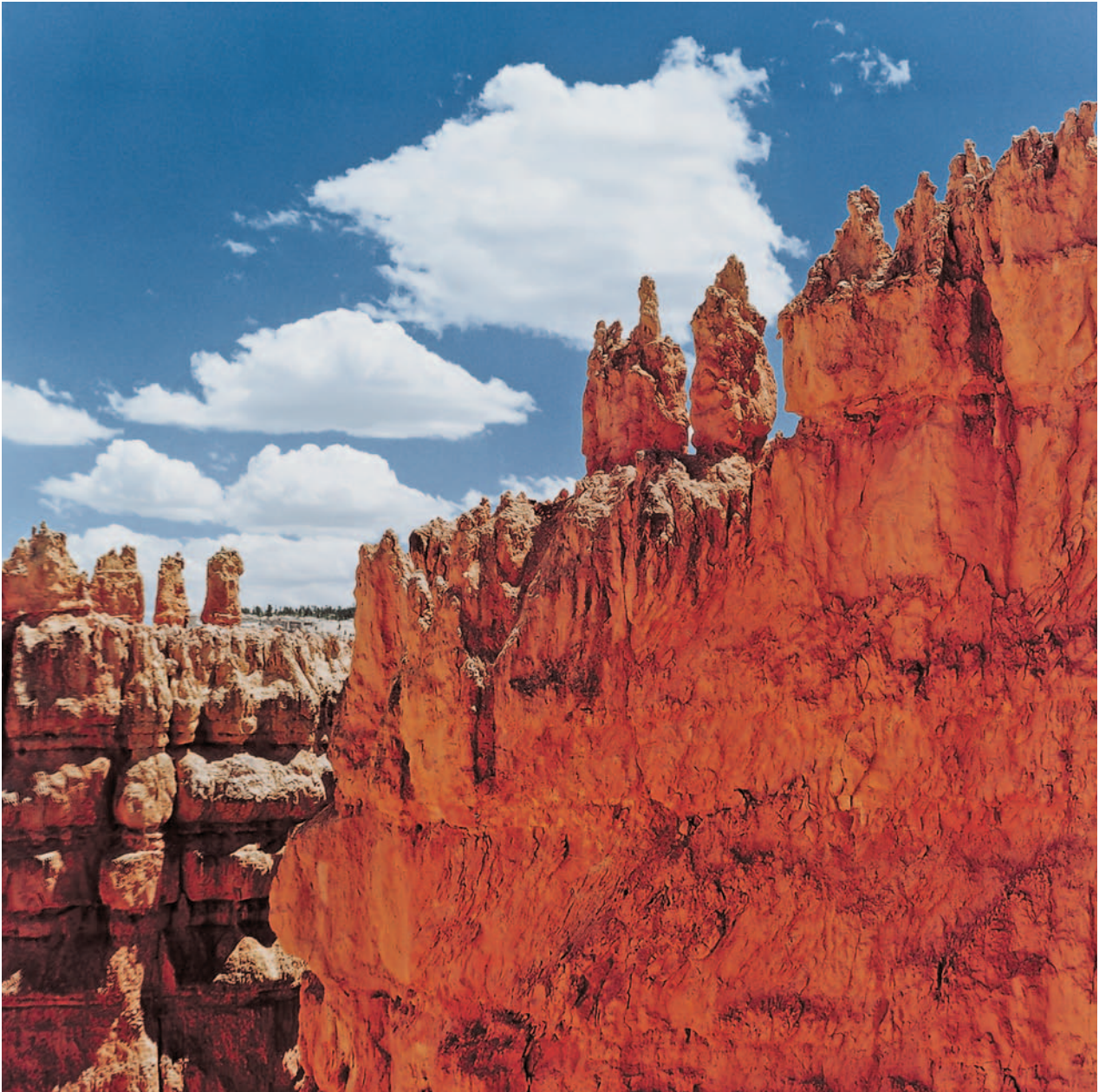
Bryce Canyon, Utah

Copyright © 2012 Massachusetts Medical Society.